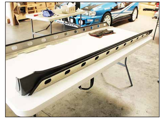
Repeat all the steps on the opposite side rocker panel.