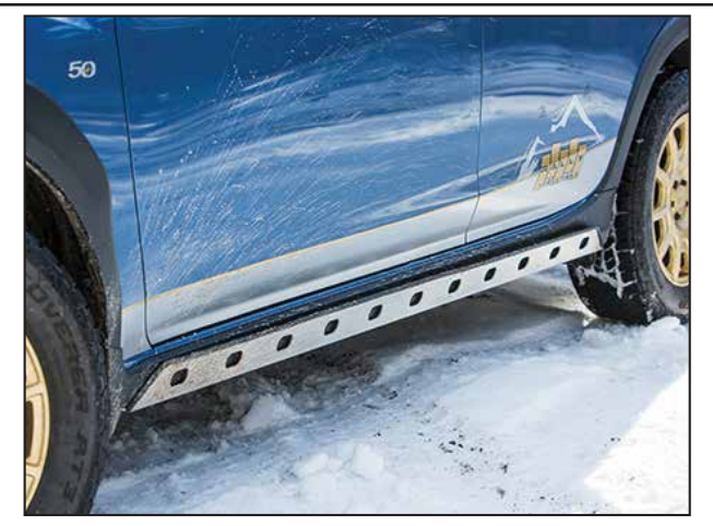
Reinstall the rocker panels in the factory location and return all factory fasteners to corresponding holes.