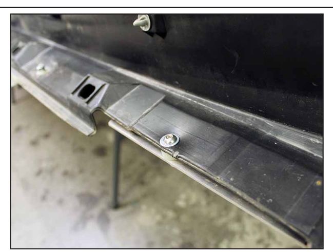
Drill out the (2) end holes with a 1/4" drill bit and install the 1/4" hardware in the orientation as follows, 1/4" Buttonhead Bolt (head facing the sky), 1/4" Washer, Spacer (inbetween the rocker guard and factory plastic), 1/4" Washer, and 1/4" Lock Nut. Repeat on the opposite end hole.