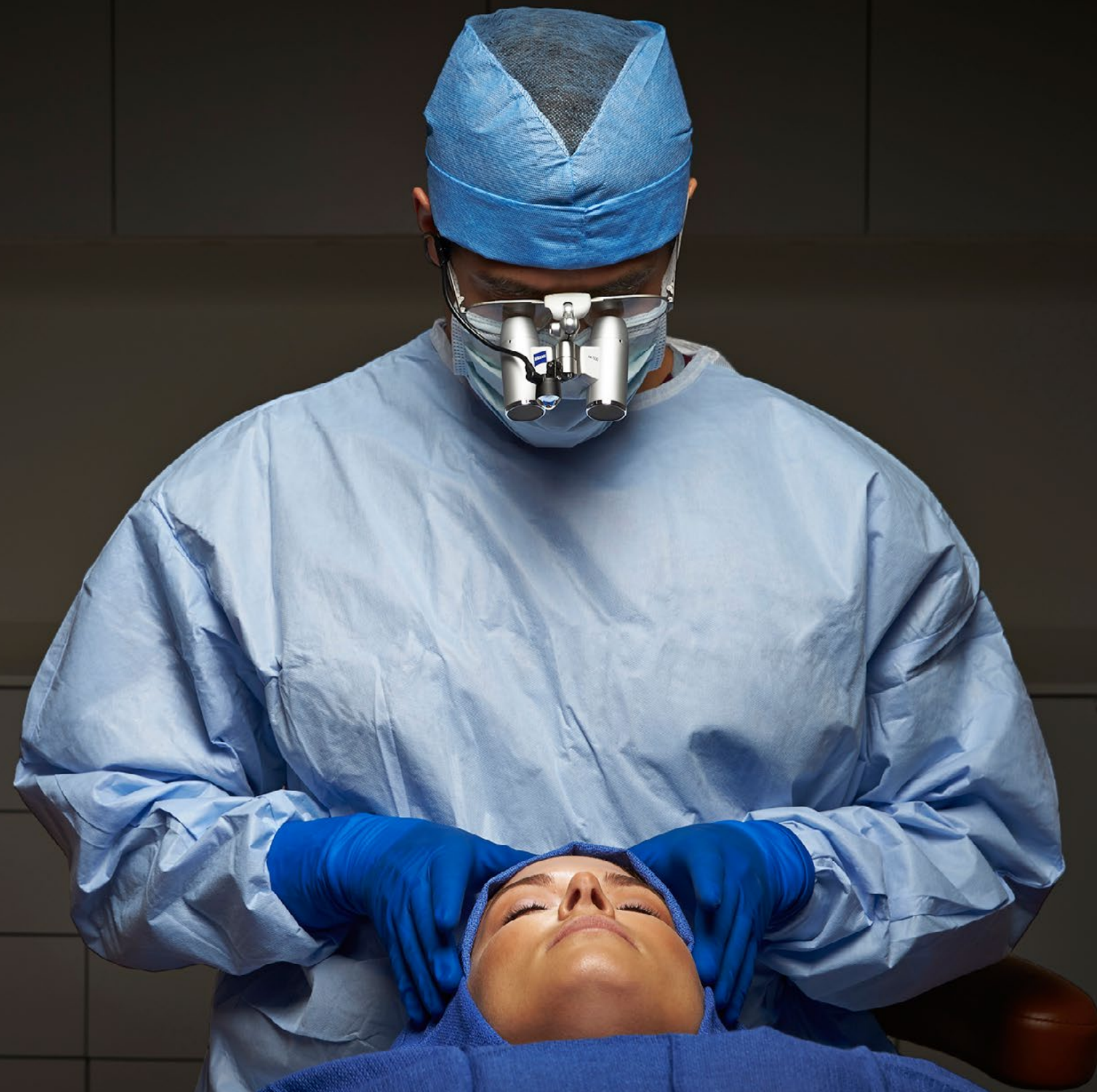
2 YEARS POST-SURGERY