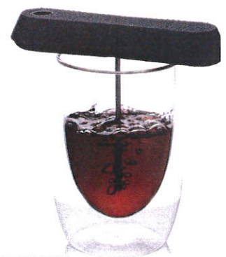
Eparé debuted a pocket wine aerator.