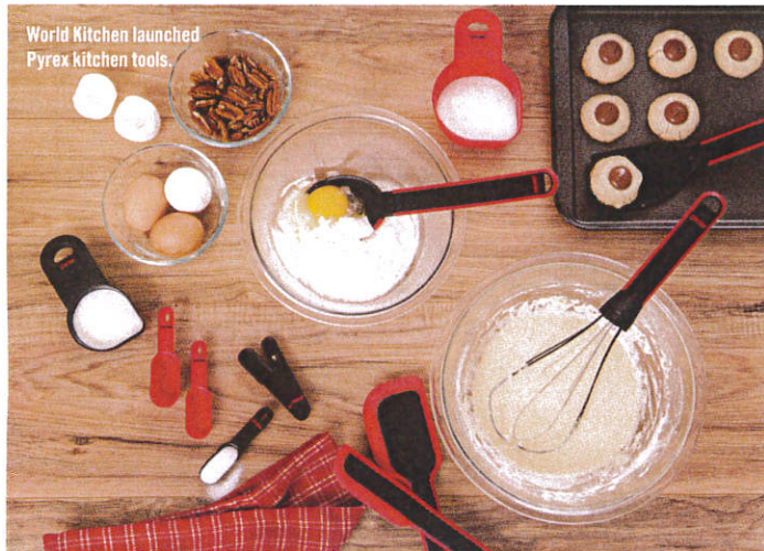
World Kitchen launched Pyrex kitchen tools.