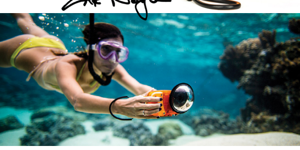
*Includes: ID Threaded Lens Bezel for Accessory 32mm Screw-In Watershot® Color Correction Filters ** Features OD Knurled Lens Bezel for Accessory 64mm Snap-On Watershot® Color Correction Filters

Zak Noyle Pro Model (right) with Wide Angle Dome Port (below)