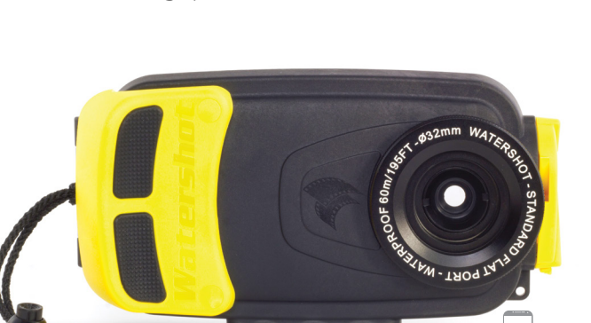
COMPATIBLE WITH REMOVABLE LENS PORT WITH THREADED LENS BEZEL For Accessory Lenses & Filters

The Watershot® Camera Housing for the Samsung® Galaxy is available for both the S3 and S4 models. Building off the proven popularity of the Watershot® PRO, both of the Galaxy Camera Housings have a depth rating of 195ft/60m. An ergonomic and rubberized right hand grip and a wrist lanyard affords improved handling and security in all conditions. The base of the Camera Housing features a prominent, robust and simple integrated metal mounting plate. Machined with a series of three standard 1/4-20 threaded tripod holes and two anti-rotation holes intelligently spaced, this mounting plate will also accommodate the Watershot® Accessory PRO Mount for utilizing endless Go-Pro® mounting options.