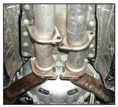
FIG. D INS5036 12/06/12