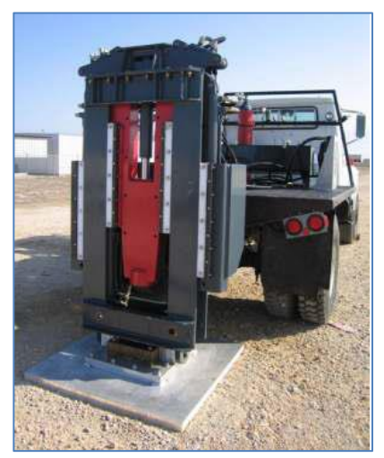
Compatible with All Impact Sources