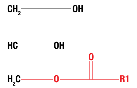
Figure 1. Monoglyceride Chemical Representation in MaxSimil Fish Oils (R1 = fatty acid)

Unique structure: One fatty acid attached to a glycerol backbone provides two polar ends that attract water and a non-polar tail end (R1) that attracts fat, thus enabling self-emulsification of the Omega 3 MG formulas.