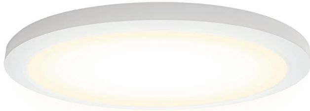
Shown in White

* requires Kinetic Control System or the CLEANLIFE® 12-60V PWM Wired Dimmer Switch