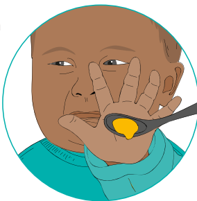
Ka parea atu te kai, tō ringa rānei

Mōhio tonu ngā pēpi mēnā kua kī tana puku.