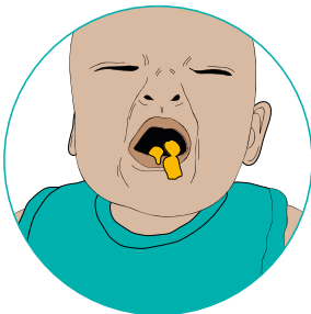
Ka tuhaina te kai