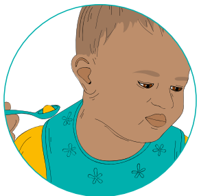
Ka huri kanohi atu