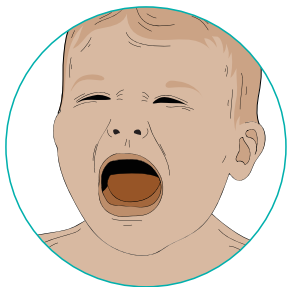
Ka tangi pākatokato