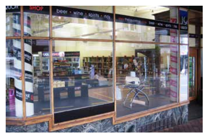
Example of good visibility into store