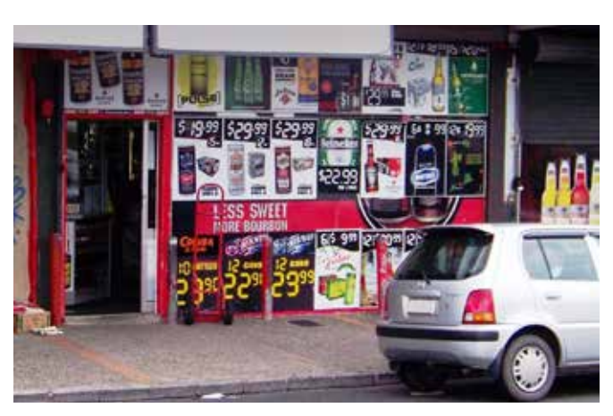
Example of obstructed visibility into store