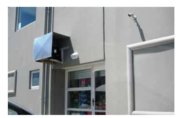
Example of CCTV at rear of premises