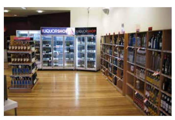
Example of good visibility of interior of store