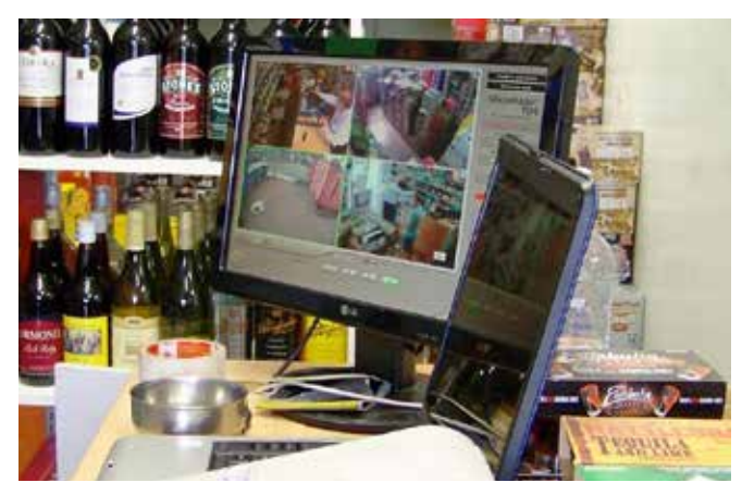
Example of CCTV monitor

Delaying the entry of offenders reduces crime and the chances of staff injury.