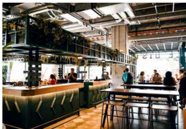
Example of good internal layout