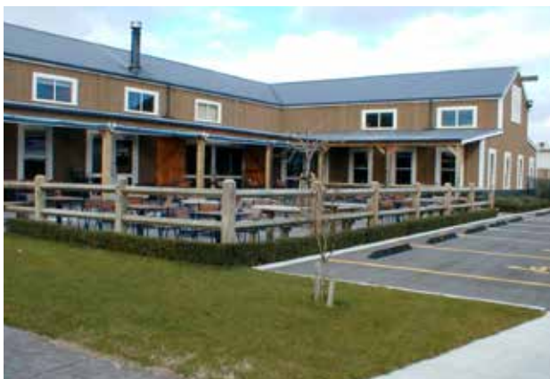
Example of a well designed outdoor drinking area