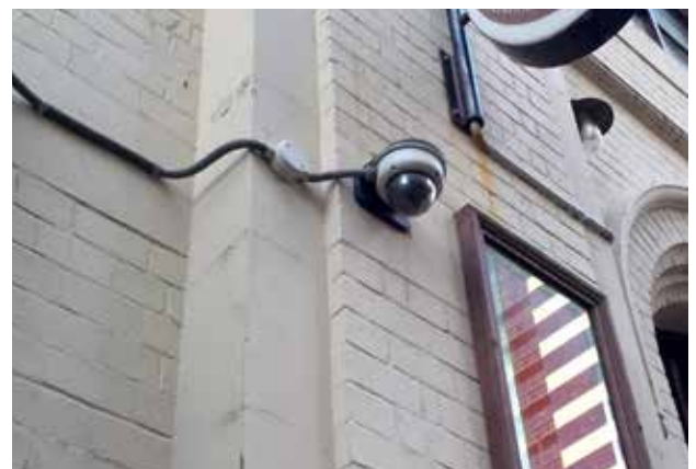
Example of CCTV surveillance at the entrance/exit of a bar