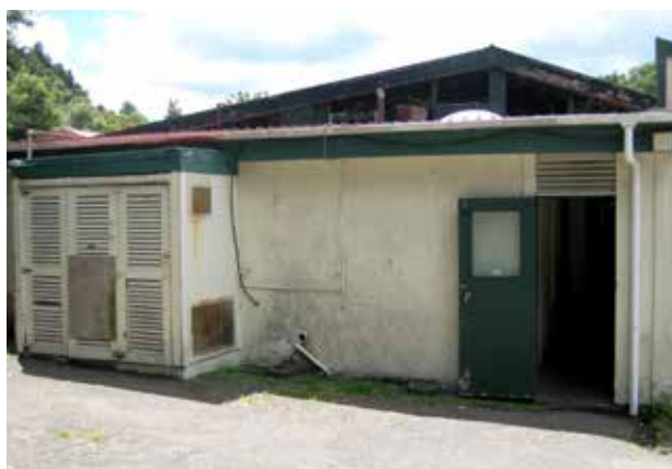
Example of unlit rear of a bar