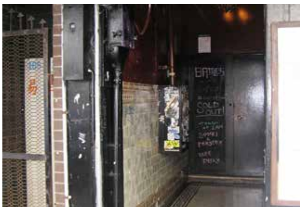
Example of poor entranceway to a nightclub