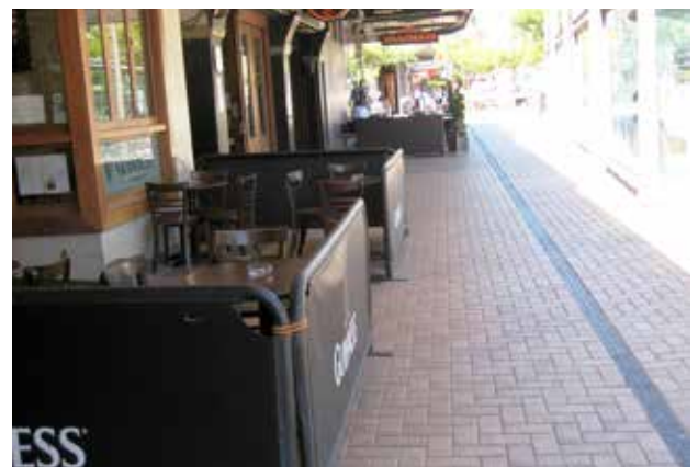
Example of good demarcation of outdoor drinking area