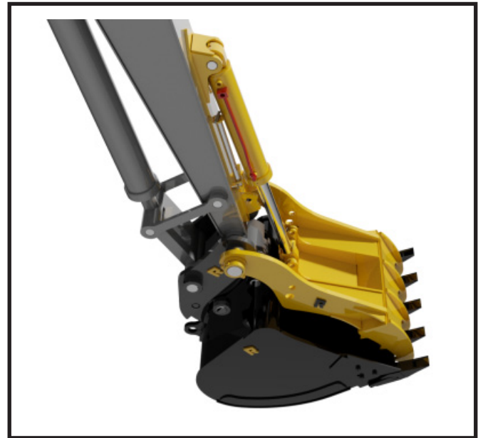
WHP Pin Mounted Hydraulic Thumb