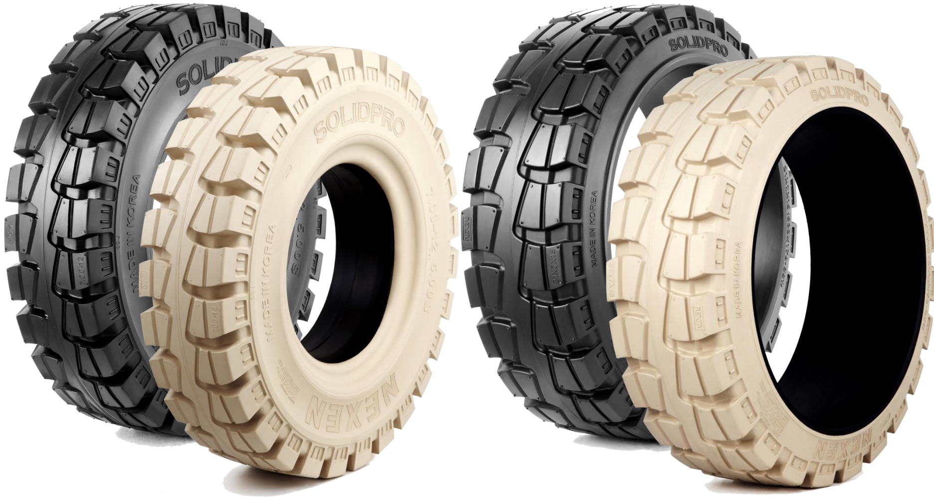
Pneumatic-shaped Solid Tires