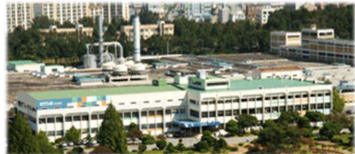
Gwangju Factory, Korea Annual Shipment : 1,500 Mil Packs

Japanese Tobacco Brand is being produced in this factory by OEM.