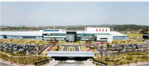
Yeongju Factory, Korea Annual Shipment : 2,200Mil Packs