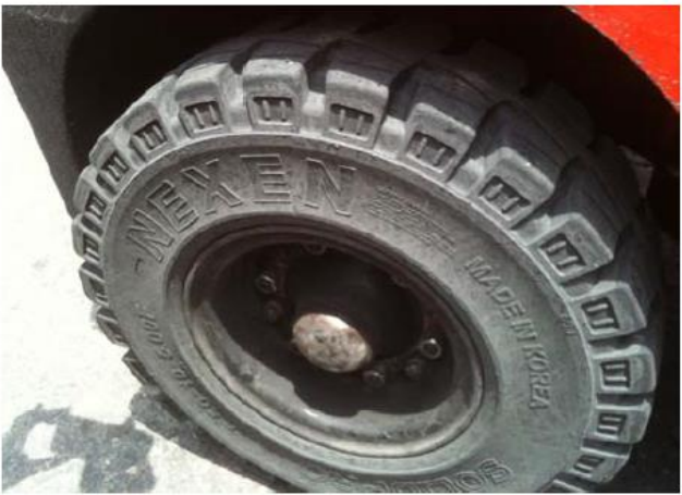
CoCa-Cola Warehouse in Philippines