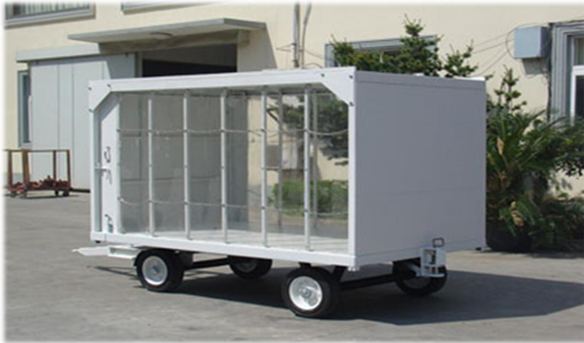
Dolly (Special Equipment used in Airport Ground Service)