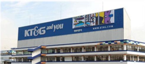
Shintanjin Factory, Korea Annual Shipment : 3,000 Mil Packs