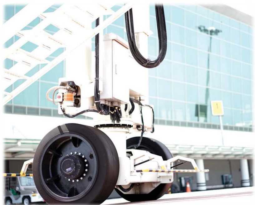
NEXEN PRESS-ON TIRE by KAC AIRPORTS