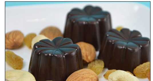
Fruit & Nut