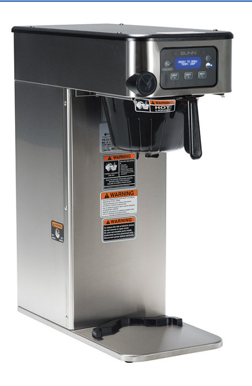
Infusion Series ICB-DV Dimensions: 10.0" x 26.8" x 22.0" (25.4 cm x 68.1 cm x 55.9 cm)