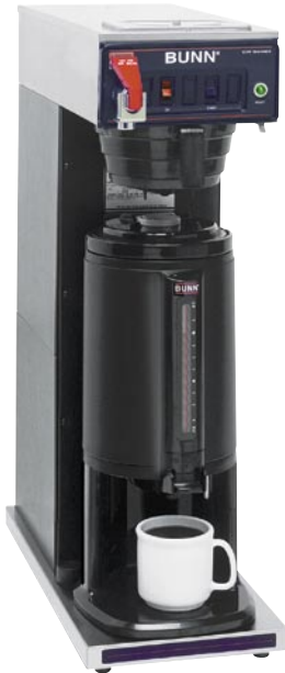
Model CWTF TS* with Thermal Server (Thermal Server not included) Dimensions: 27.6" H x 9" W x 18.5" D (70.1cm H x 22.9cm W x 47cm D)