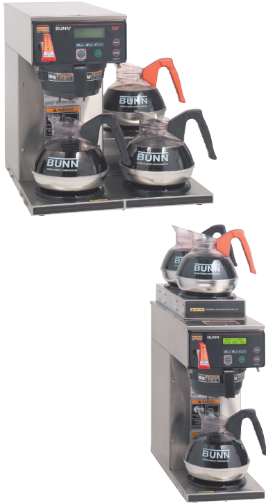
Model AXIOM-15-3 (decanters sold separately)

For current specification sheets and other information, go to www.bunn.com .