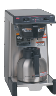
WAVE-S-APS with 1.9L Thermal Carafe (sold separately)