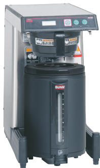
WAVE-APS with 2.5 litre Thermal Server (sold separately)