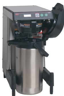
WAVE-APS with 2.5L Airpot (sold separately)