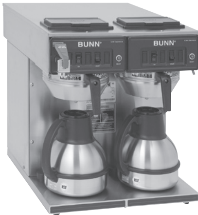
CWTF Twin-TC Shown with Thermal Carafes (thermal carafes sold separately)

Dimensions: 17.2" H x 16" W x 22.5" D (43.7cm H x 41cm W x 57.2cm D)