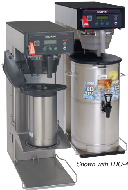
Shown with TDO-4