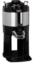
TF SERVER, 1G/3.8L MECH