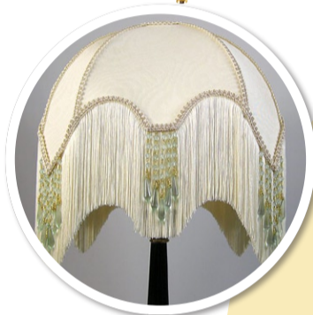
Cream moire taffeta lampshade, from £168, thelampshadeshop.com