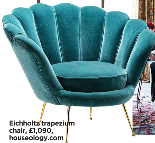
Eichholtz trapezium chair, £1,090, houseology.com