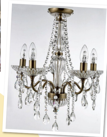
Luxe Collection Alessandra Flush 5-light chandelier, £99, very.co.uk. Below: Pearl Lowe