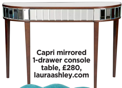
Capri mirrored 1-drawer console table, £280, lauraashley.com