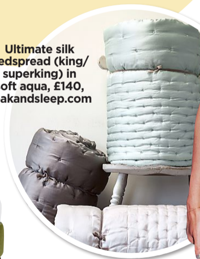
Ultimate silk bedspread (king/superking) in soft aqua, £140, soakandsleep.com