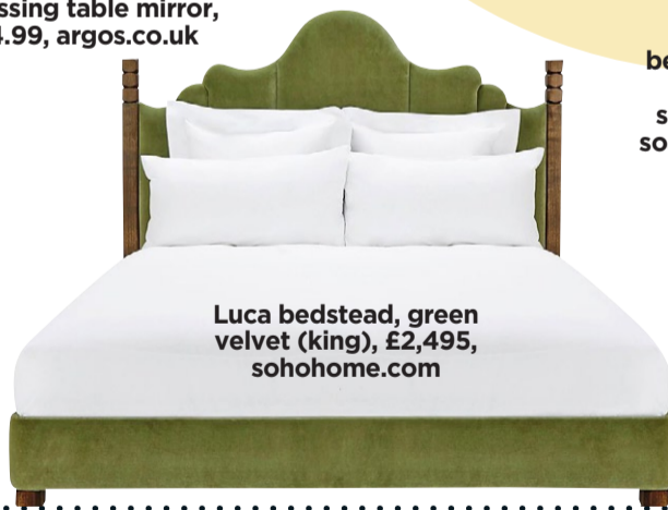
Luca bedstead, green velvet (king), £2,495, sohome.com