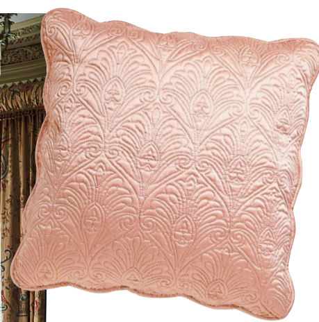
Damask cushion cover with metallic thread, £19.99, zarahome.com. Left: The look you're aiming for