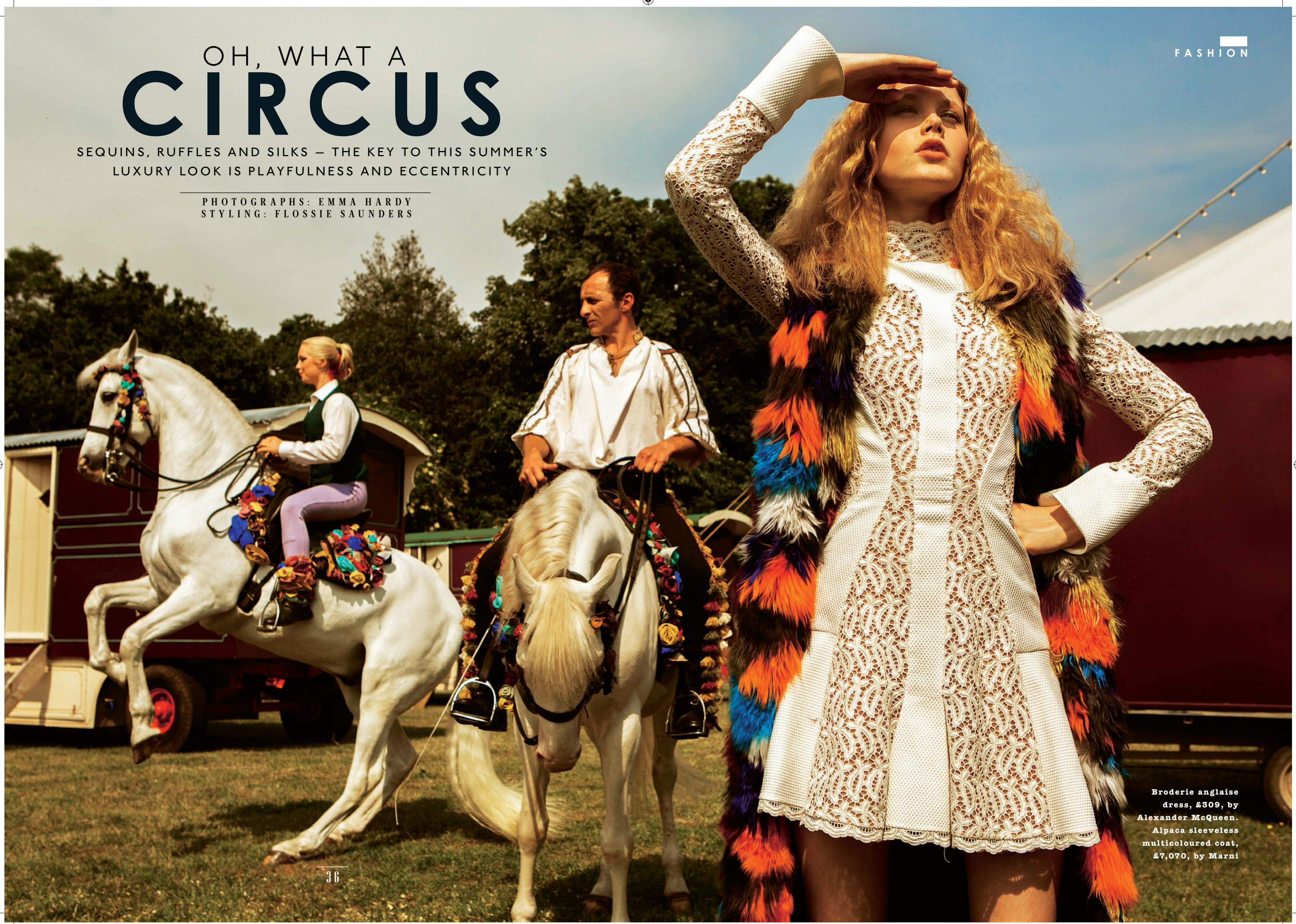
Broderie anglaise dress, £309, by Alexander McQueen. Alpaca sleeveless multicoloured coat, £7,070, by Marni