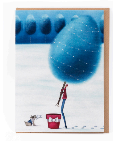
Potting the Tree