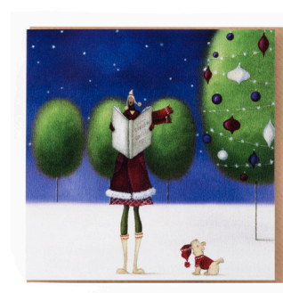
Canine Christmas Carols