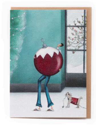
Decking the Tree