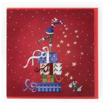
Catching Christmas Stars