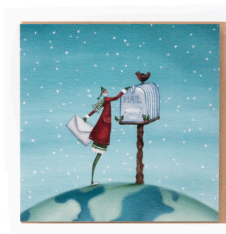
Last Post for Christmas