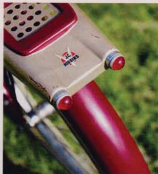
GLASS REFLECTORS 1951 J.C. Higgins-brand bike