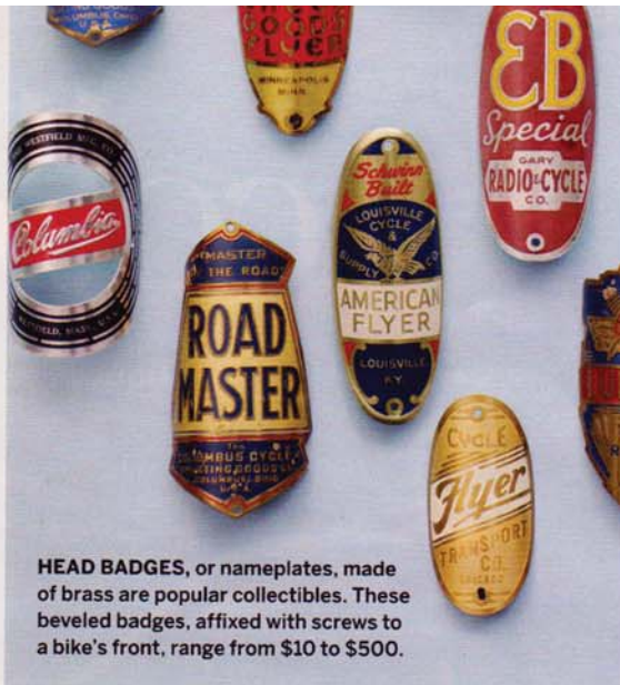
HEAD BADGES , or nameplates, made of brass are popular collectibles. These beveled badges, affixed with screws to a bike's front, range from $10 to $500.

B icycles were often our first experience of freedom. As kids, when we mastered that moment of finding a balance on two wheels, we were suddenly able to pedal away into neighborhoods beyond our own. All we needed was a strong headlamp, clean reflectors, and a clear-sounding bell. "I think the reason most people buy a vintage bike," says Craig Morrow, owner of Bicycle Heaven, a Pittsburgh-based source for antique and collectible bicycles, "is that they want their old bike back—a way of regaining their youth. Or maybe a vintage bike lets people have the one they couldn't afford as a kid." Models from the 1940s to the '70s are the most coveted, and Morrow gets calls from as far away as Japan and Australia.