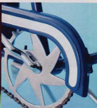
SKIP-TOOTH SPROCKET c. 1948 men's bike