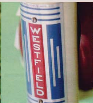
HEAD BADGE 1938 Columbia model