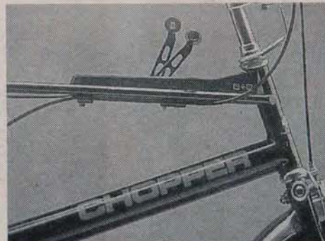
For some, only a chopper will do.

Regardless of what you will believe, restored examples of Schwinn's "Krate" and "Sting-Ray" series are regularly posting on eBay and dedicated bicycle collector sites. And, if you just happen to be sheltering a diamond-in-the-rough in Mom's basement... well, NOS parts (automotive terminology for "new old stock"; refers to original parts still out there which have never been used) are avail-