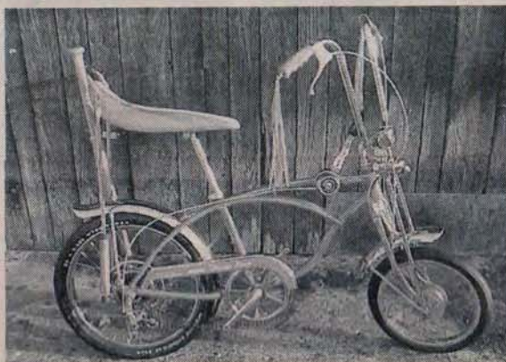
The Orange Krate: an epitome of lowrider design.

able (try BikeIcons, or Bicycle Heaven for parts sources), and the whole deal is certainly less cumbersome