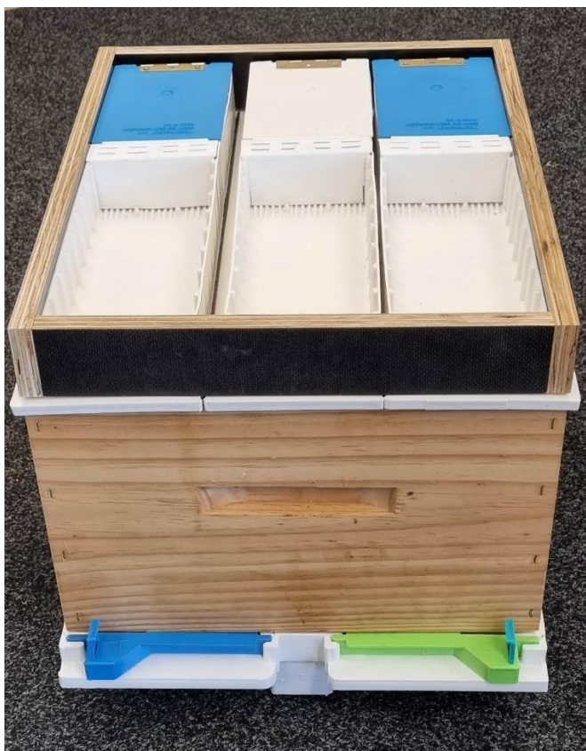
The 3 top feeders fitted and wooden rim.