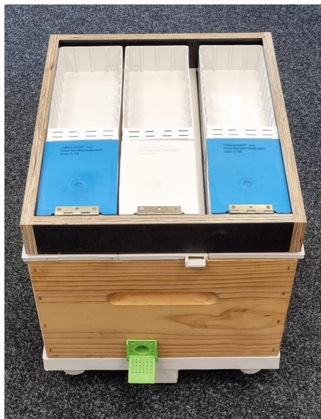
Back of the hive showing top entry and the Q8 entry fitted for the middle nucleus hive.