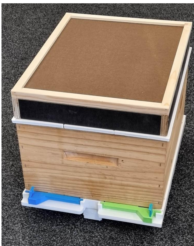
Fit hive mat to ensure all feeders are robber-proof. If both rear entries are fitted, we recommend leaving the top one closed.