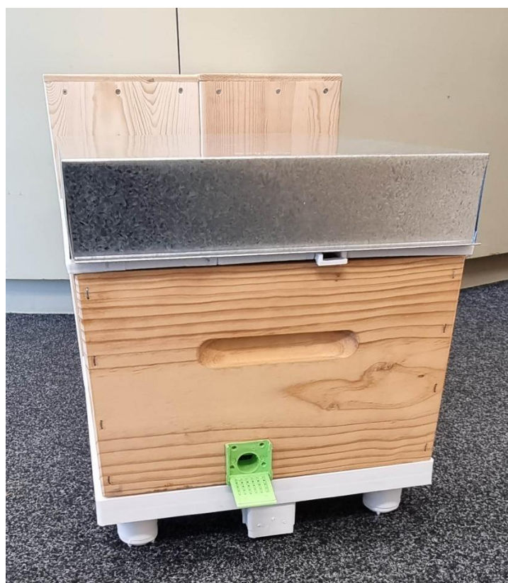
Lid fitted and rear entries shown above.