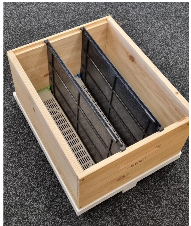
Brood box fitted with divider boards located into nuc entry slots.

The divider boards may need to be lightly trimmed on the ends to fit into some of these boxes in NZ.