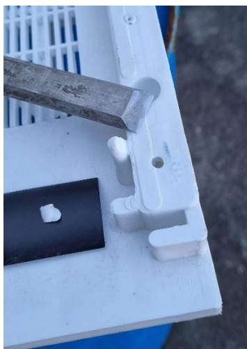
Cut small chunk from lug to locate box. (May be done already)

The divider boards may need to be lightly trimmed on the ends to fit into some of these boxes in NZ.