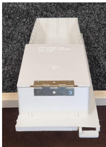
Middle feeder with entry open.