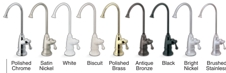
Polished Chrome Satin Nickel White Biscuit Polished Brass Antique Bronze Black Bright Nickel Brushed Stainless

Above finishes available in Hot Only and Hot & Cold Faucets in both Designer and Contemporary styles.