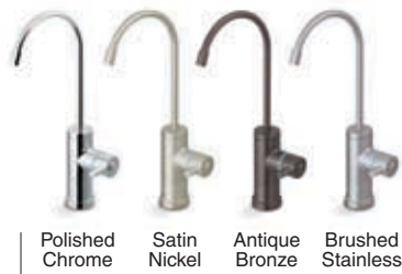
Polished Chrome Satin Nickel Antique Bronze Brushed Stainless