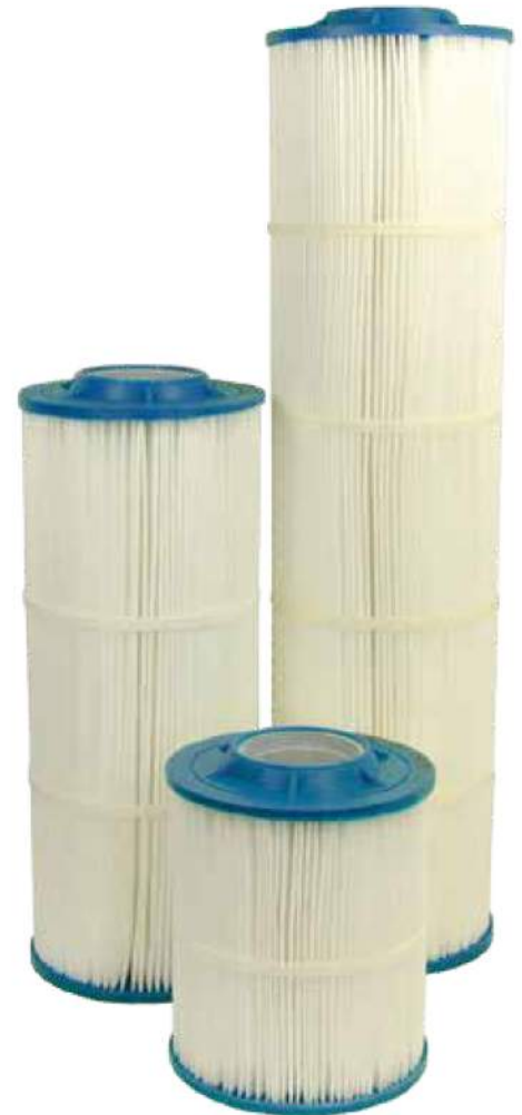
Premium Hurricane® Polyester Cartridges