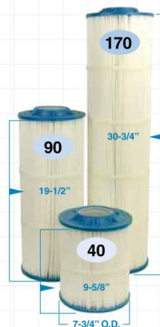
Premium Hurricane® Polyester Cartridges