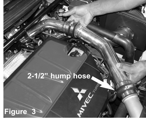
Install the 2-1/2" hump with clamps provided to the factory intercooler pipe. Install the longer pipe and connect the 2 pipes together. Position for best fit, re adjust if necessary. Tighten all clamps using 8mm nut driver. Your installation is now complete.