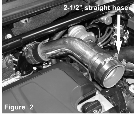
Install the short pipe to 2" straight hose. Attach the 2-1/2" straight hose with clamps provided to other end of pipe. Do not tighten.