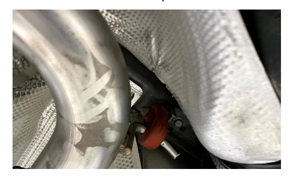
12. INSTALL SLIP ON TIPS, ORIENTAT AS PICTURED TIGHTEN 10MM CLAMP ONCE POSITION IS AS DESIRED.