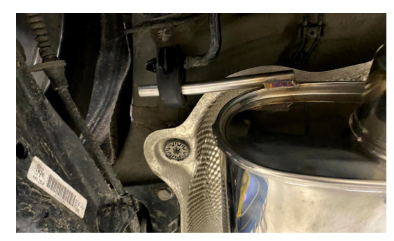
11. TIGHTEN ALL VBAND CLAMPS STARTING FROM THE DOWNPIPIE TO RESONATED CONNECTION, THEN RESONATOR TO MUFFLER SECTION, AND LASTLY MUFFLER TO