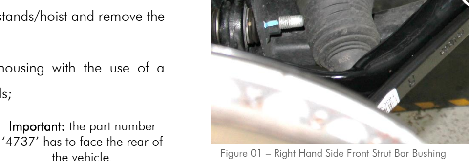
Note the shell line aligned with the strut bar bush housing surface. Some bushes will have this line on the opposite side,

Important: the tube flange should face towards the front of the vehicle