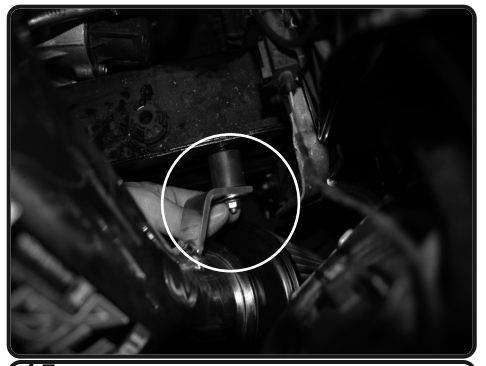
15. Now position the intake tube. Position the bracket to the vibramount secure using provided M6 nut and fender washer.