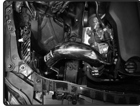
19. Verify all components are tight. Re-install the front plastic cover.