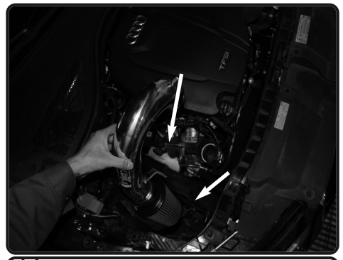
14. Install the intake assembly into the vehicle.