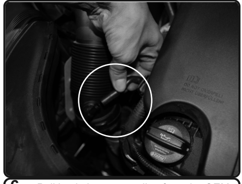
6. Pull back the vacuum line from the OEM intake tube.