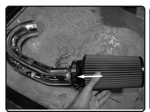
12. Install the filter to the tube.