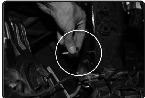
9. Now install the provided M6 vibramount to the thredded stud on vehicle frame. Secure and tighten.