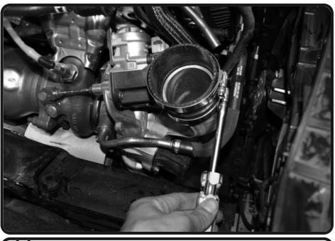
11. Tighten the clamp on turbo only.