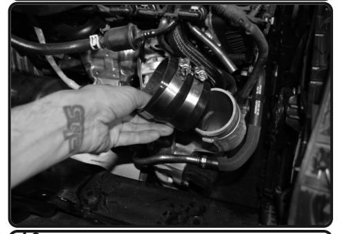
10. Install the provided step hose with clamps provided to turbo.