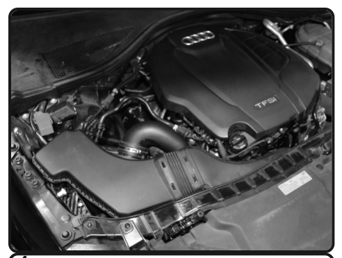
1. Stock intake system shown.