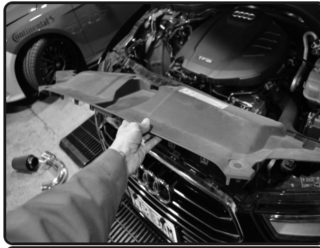
3. Now remove the plastic cover.