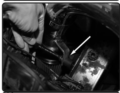
16. Tighten bracket using 10mm socket or wrench.