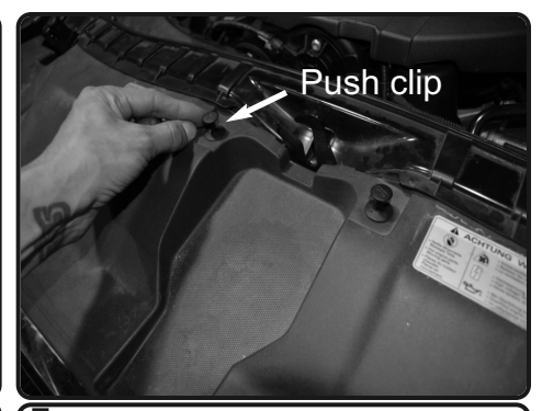
7. Carefully remove the push clips using flat head or panel clip removal tool.