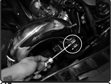
17. Secure the hose and tighten clamps using 8mm nut driver.