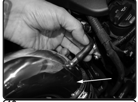
18. Connect the vacuum line to the fitting on the intake tube.