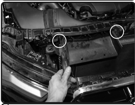
4. Locate the 2 bolts holding in the front air scoop and loosen and remove using T25 torx bit.