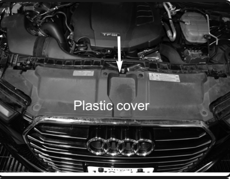
2. Front plastic cover needs to be removed for access to the air box scoop.