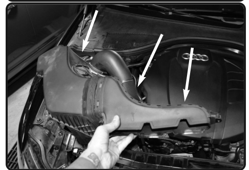
8. Carefully lift up and remove the entire air box assembly out of vehicle.