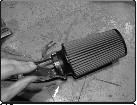
13. Secure and tighten using 8mm nut