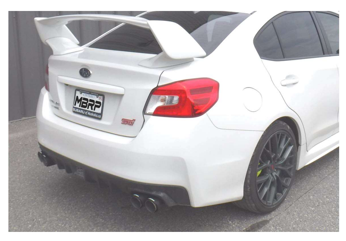
Congratulations! You are ready to begin experiencing the improved power, sound and driving experience of your MBRP Performance Exhaust. We know you will enjoy your purchase!

7. Tighten all hardware and clamps, starting at the front and working rearward to secure the system. Check along the full length of the exhaust system to ensure there is adequate clearance for fuel lines, vent lines, brake lines, frame, bodywork, suspension and any wiring, etc. If there is any interference detected, relocate or adjust to provide adequate clearance.