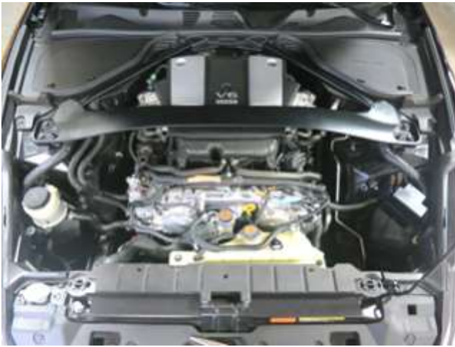
g. Lift each air box up and out of the vehicle, releasing them from their grommets. Then, remove the air hoses.