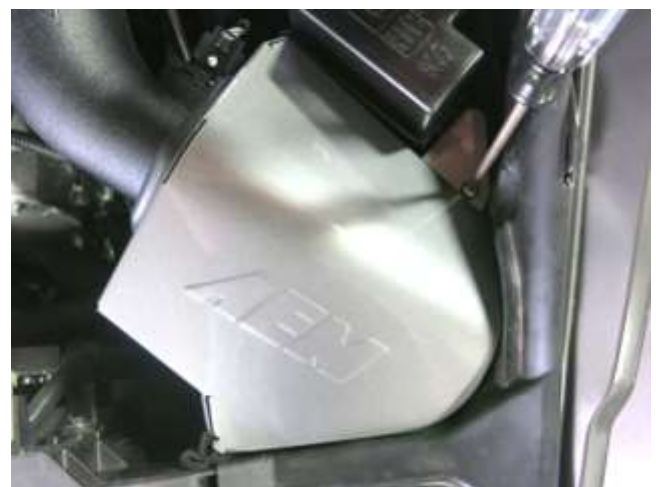
n. Pull the driver side heatshield into position and secure with the provided hardware. Ensure the fuse box latch is below the heatshield lip.