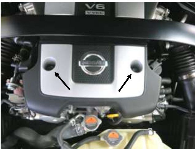
a. Remove the front half of the engine cover by loosening its two bolts.