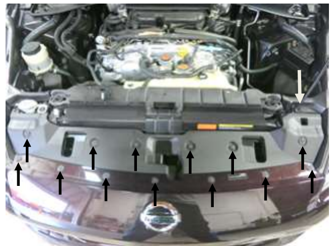
j. Remove the 14 plastic push-rivets and then remove the plastic radiator shroud. Note: The push-rivet denoted by a white arrow is a unique size.