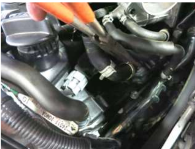
i. Remove the driver side PCV hose and set aside. This will be reused.