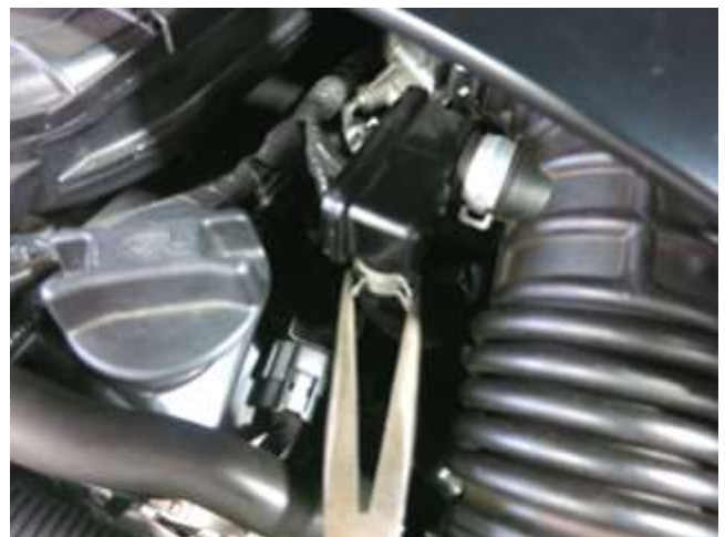
d. Disconnect the PCV hose on the driver side by releasing pressure on the spring clamp.