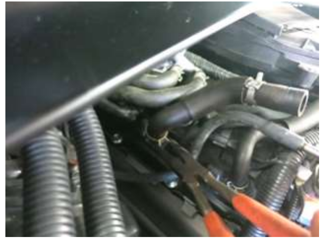
h. Remove the passenger side PCV hose. Remove the hose clamps; these will be used later.