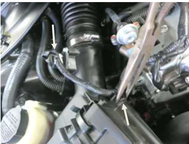
c. Release the Mass Air Flow (MAF) sensor harness and disconnect the connector on both sides of the vehicle.