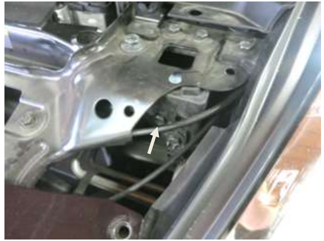
l. Remove the bolt securing the driver side air ducting.