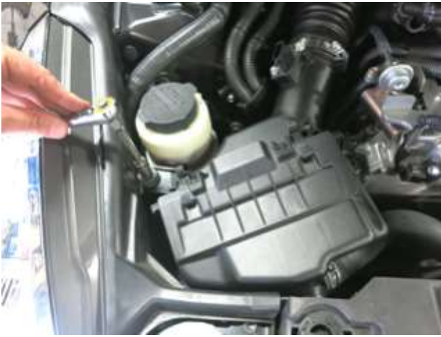
e. Remove the bolts securing the factory air box on each side of the vehicle.