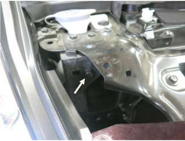
k. Remove the bolt securing the passenger side air ducting.