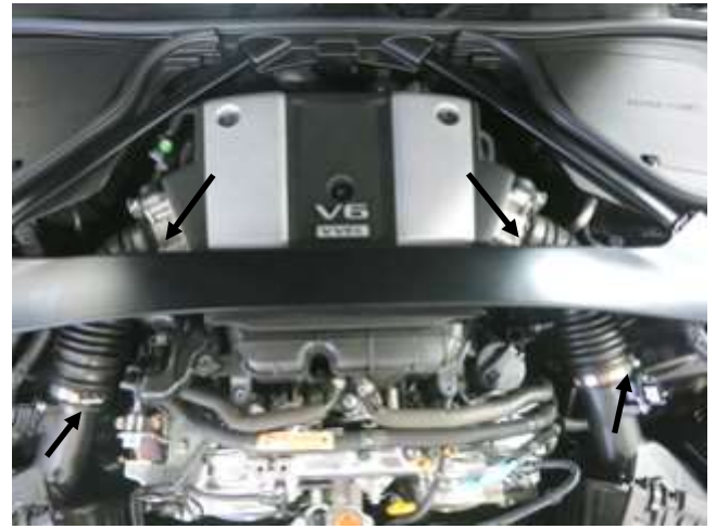
f. Loosen the four hose clamps on the factory air hoses.