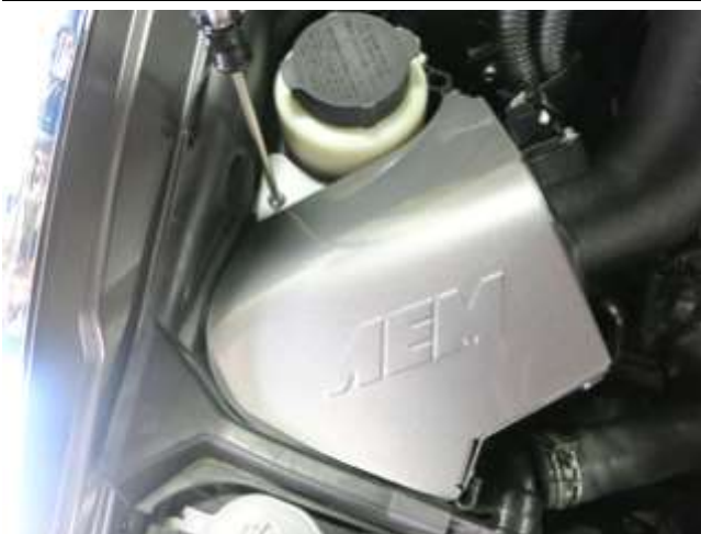
n. Pull the passenger side heatshield into position and secure with the provided hardware. The heatshield should clear the power steering reservoir and the power steering hose should route through the cutout.