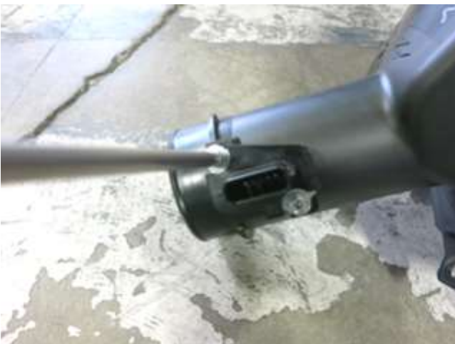
o. Remove both MAF sensors from their factory air boxes. Note: Do not discard any of your stock equipment.