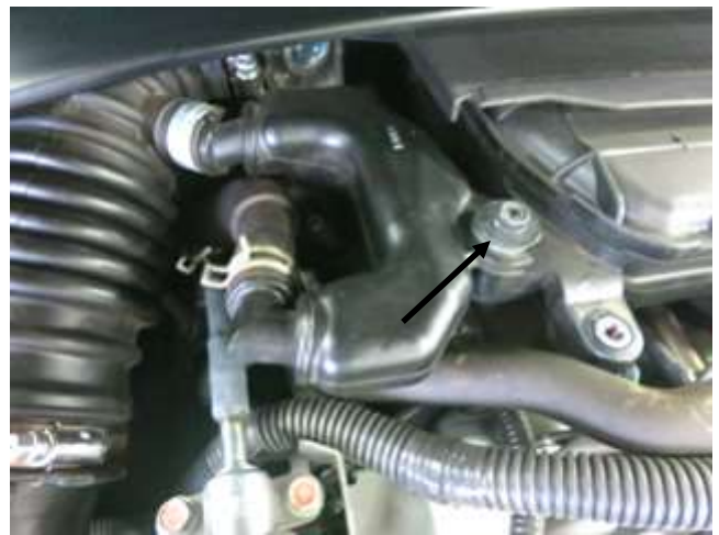
b. Remove the bolt securing the PCV hose fitting on the passenger side.