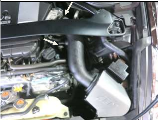
m. Connect the PCV hose and insert the tube into the coupler. Secure the PCV hose with the spring clamp at this time.