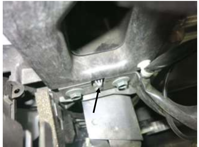
n. Use needle nose pliers to squeeze the retaining clip to release the air ducting on both sides of the vehicle. Remove the air ducting.