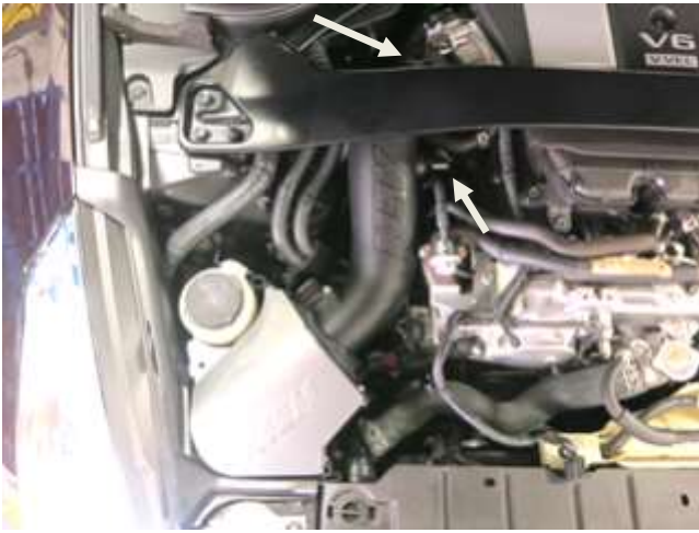
k. Push the passenger side heatshield down into the grommets as shown. Then, connect the PCV hose and secure it with the spring clamp. Then, insert the tube into the coupler.