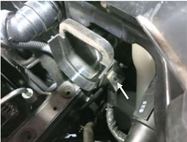
m. Release the wiring harness from the passenger side air ducting.