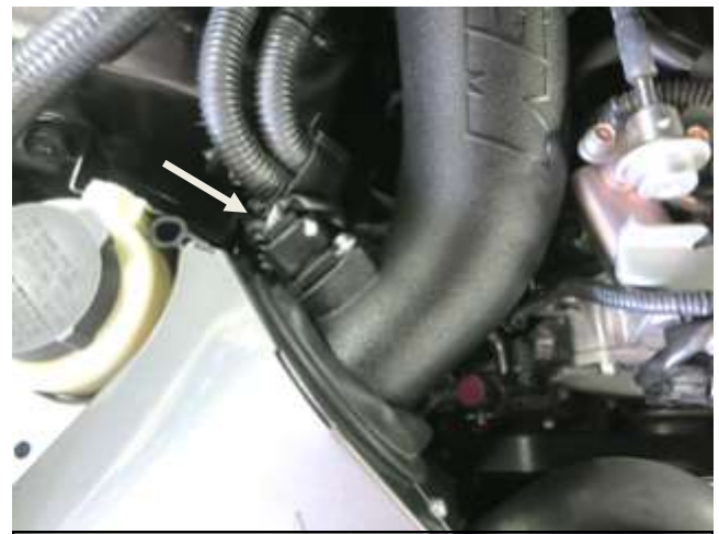
n. Route the MAF harness under each tube and connect the harness to the sensor on each side of the vehicle.