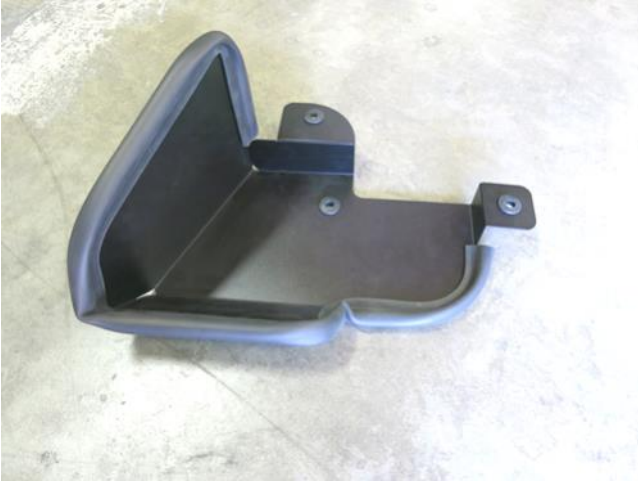
a. Install the provided edge trim and rubber grommets onto the AEM heat shield as shown.