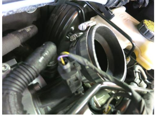
b. Install the provided coupler and hose clamps onto the turbo with the small end towards the turbo inlet. Tighten the turbo-side hose clamp to 30in-lb at