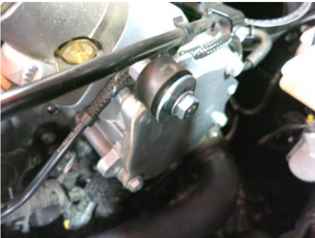
c. Install the provided rubber mount onto the side of the engine. Loosely install the provided washer and nut onto the tuber mount.