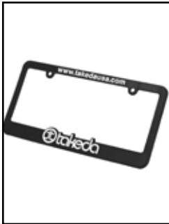
Takeda Lic. Plate Frame