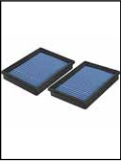
OE Replacement Filter

P/N: 30-10271-MA (P5R) 31-10271-MA (PDS)