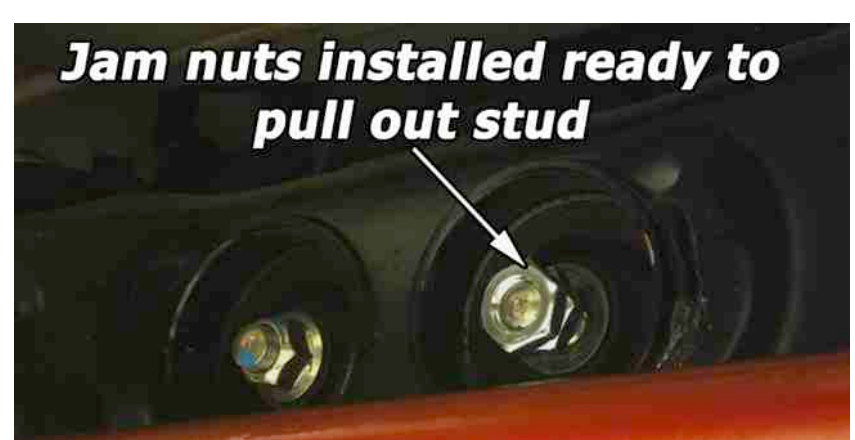
Shows nut removed, and jam nuts installed ready to remove stud from diff cover.