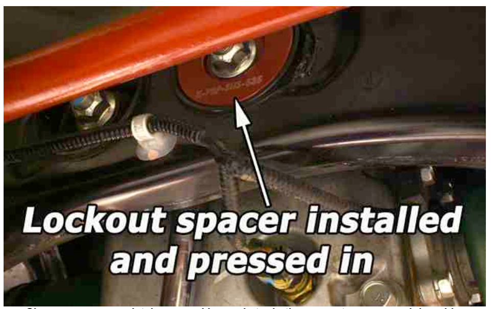
Shows spacer completely pressed in, ready to do the same steps on remaining side.