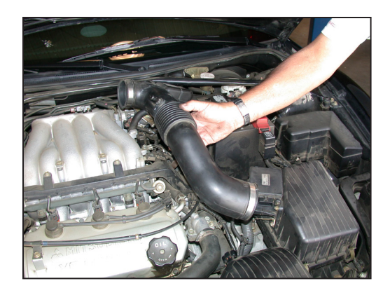
5. Loosen the hose clamps at the throttle body and at the mass air sensor, then, remove the stock intake tube as shown.