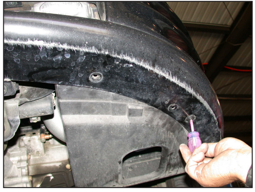
30. Reverse the removal process and re-secure the lower valance as shown.

31. Tighten all hose clamps and brackets and check for proper clearance.