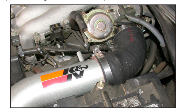
14. Slide the intake tube assembly onto the throttle body as shown but do not tighten.