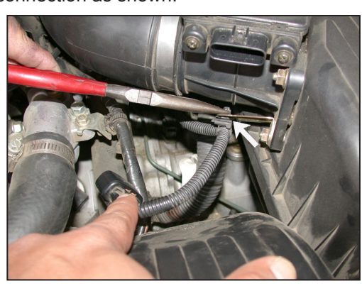
3. Unclip the mass air sensor wire harness from the stock hanger as shown.