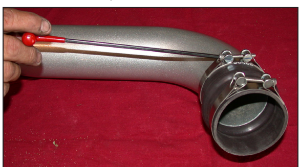
21. Install the silicone hump hose and hose clamps onto the cold air intake tube and tighten as shown. NOTE: Before installing the silicone hump hose, inspect the inside of the tube for any debris, then clean the inside out with water and a towel. Inspect the tube one more time before proceeding to the next step.