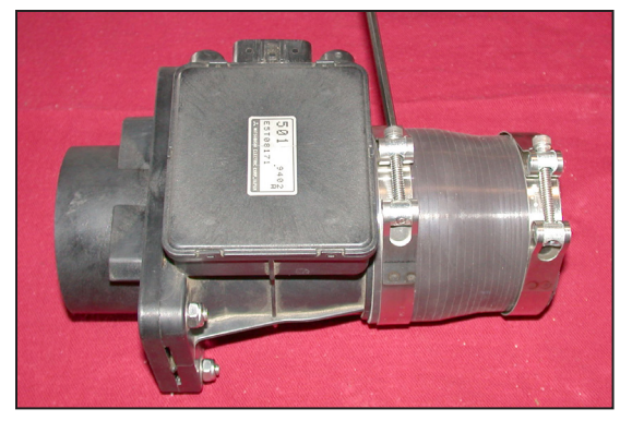
17. Install the silicone step hose and hose clamps onto the mass air sensor and tighten as shown.

NOTE: The longest cap screw is used for the bracket in the orientation shown.