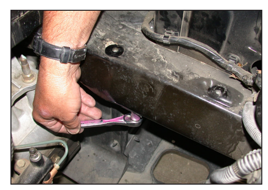
11. Remove the stock bolt on the bottom of the inner frame rail as shown.