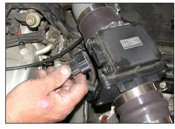
33. Reconnect the mass air sensor electrical connection as shown.