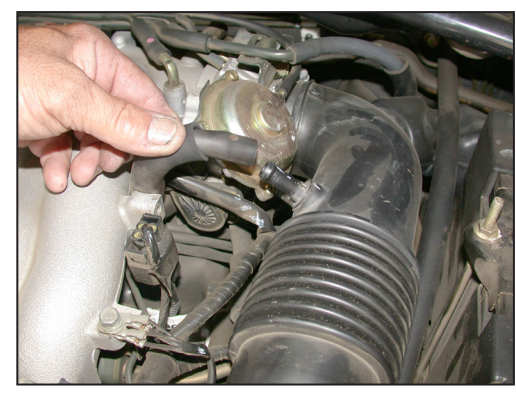
4. Disconnect the crankcase vent hose from the stock intake tube as shown.