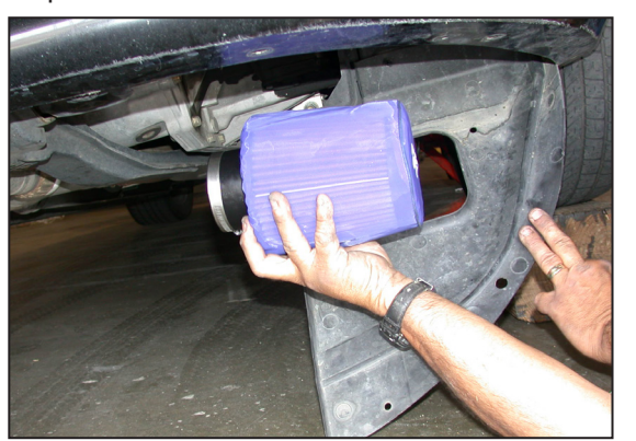
29. From underneath the vehicle install the K&N<sup>®</sup> air filter and secure with the provided hose clamp.