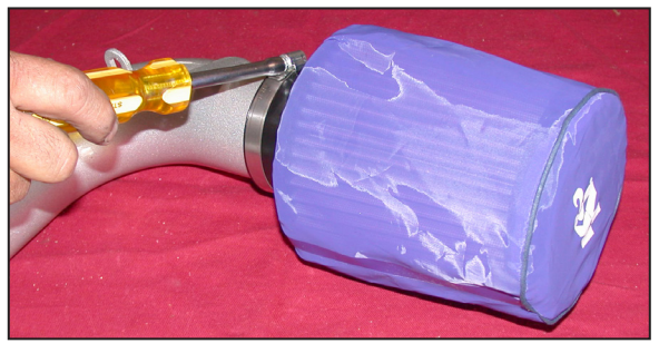
23. On manual transmission vehicles install the K\&N^{\odot} air filter onto the cold air intake tube and tighten as shown.

NOTE: Please be aware the Drycharger® is water repellent, not water proof. Depending on conditions and usage the water repellent treatment is good for 1 to 2 years. See the parts list to reorder a new Drycharger® if necessary.