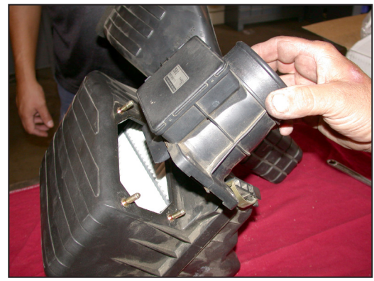
15. Remove the nuts that secure the mass air sensor to the stock air cleaner then, remove the mass air sensor as shown.