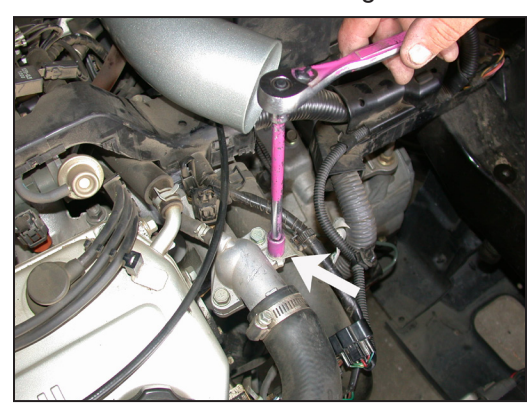
18. Remove the bolt that secures the wire harness to the stock water neck as shown.