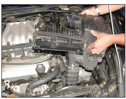
8. Remove the complete air cleaner assembly as shown.

NOTE: K&N Engineering, Inc., recommends that customers do not discard factory air intake.