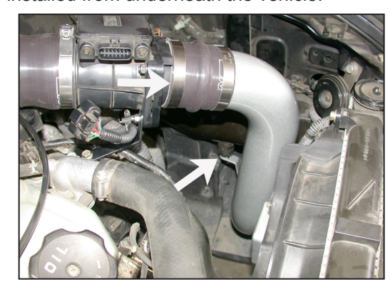
26. Slide the hump hose onto the mass air sensor, then, line up the bracket on the cold air tube with the rubber mounted stud on the bottom of the inner frame rail as shown.