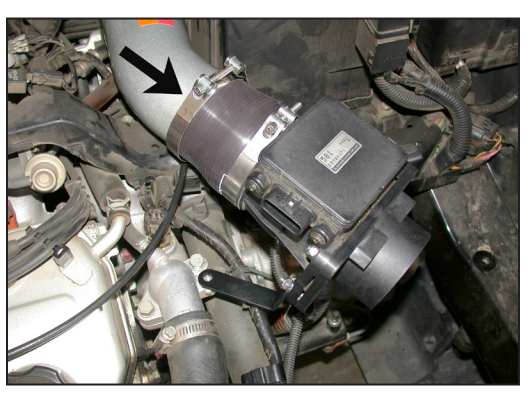
19. Slide the mass air sensor assembly onto the intake tube as shown but do not tighten.