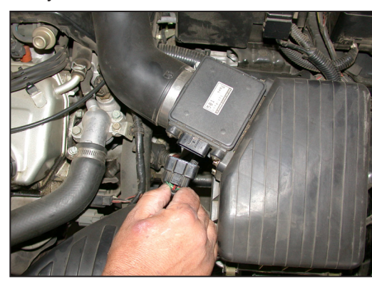
2. Disconnect the mass air sensor electrical connection as shown.

1. Turn off the ignition and disconnect the negative battery cable.