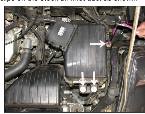
7. Loosen the 3 bolts that secure the air cleaner assembly as shown.