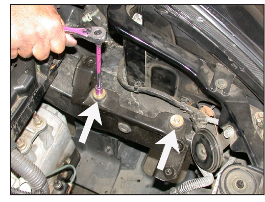
9. Remove the two bolts that secure the stock air cleaner mounting bracket as shown.

NOTE: K&N Engineering, Inc., recommends that customers do not discard factory air intake.