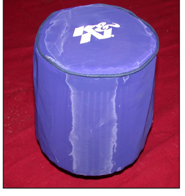
22. Install the Drycharger® onto the K&N® air filter as shown.

NOTE: Please be aware the Drycharger® is water repellent, not water proof. Depending on conditions and usage the water repellent treatment is good for 1 to 2 years. See the parts list to reorder a new Drycharger® if necessary.