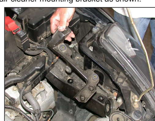
10. Remove the stock air cleaner mounting bracket as shown.