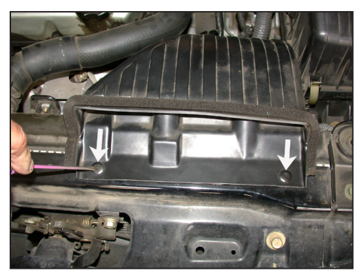
6. Depress the center pins to release the push clips on the stock air inlet duct as shown.