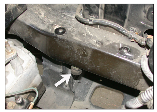
12. Install the provided rubber mounted stud into the threaded hole from step 11.