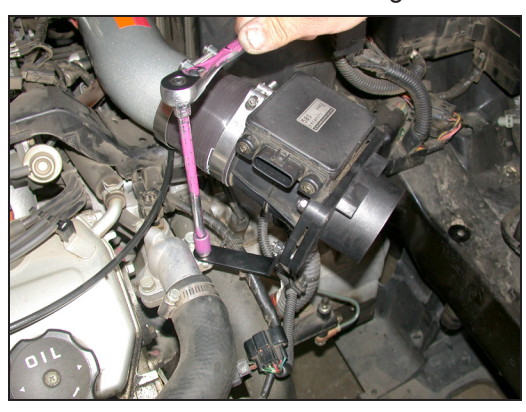
20. Secure the bracket to the water neck using the bolt removed in step 18.