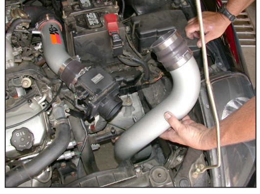
25. On automatic transmission vehicles install the cold air intake tube only as the air filter will be installed from underneath the vehicle.