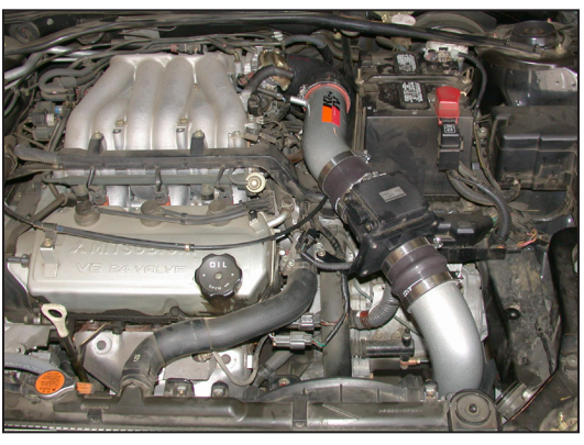
34. Reconnect the negative battery cable and double check that everything is tightened and properly positioned before starting the vehicle.