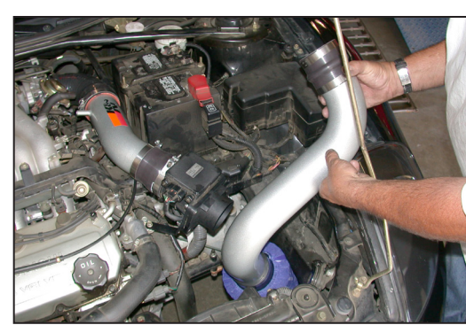
24. On manual transmission vehicles install the cold air intake tube assembly into the vehicle as shown.

NOTE: Automatic transmission vehicles will need to have the air filter installed from underneath the vehicle.