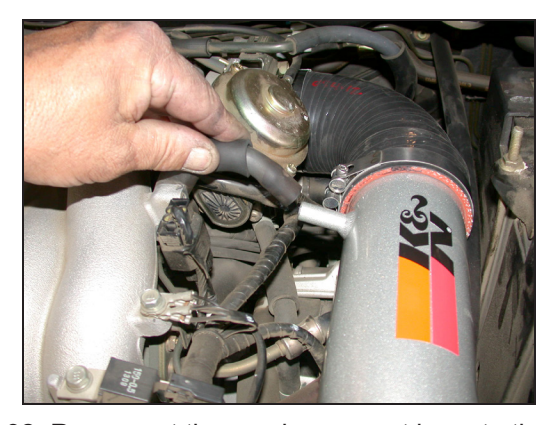
32. Reconnect the crankcase vent hose to the vent on the intake tube as shown.

31. Tighten all hose clamps and brackets and check for proper clearance.