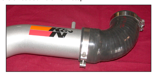
13. Install the silicone hose and hose clamps onto the intake tube as shown but do not tighten. NOTE: Before installing the silicone hose, inspect the inside of the tube for any debris, then clean the inside out with water and a towel. Inspect the tube one more time before proceeding to the next step.