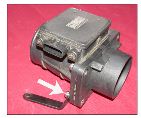
16. Assemble the provided mass air sensor adapter, bracket and the stock mass air sensor and stock gasket using the provided hardware as shown

NOTE: The longest cap screw is used for the bracket in the orientation shown.