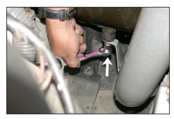
27. Secure the bracket to the rubber mounted stud using the provided hardware as shown.