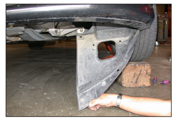
28. On automatic transmission vehicles raise the vehicle up and secure it with jack stands. Now remove the 5 screws that secure the lower valance and pull the valance back as shown.