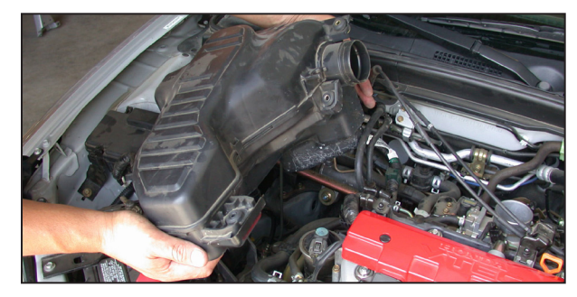
12. Unclip the throttle cable and cruise control cable (If equipped), then, remove the resonator by pulling upwards as shown.

NOTE: K&N Engineering, Inc., recommends that customers do not discard factory air intake.