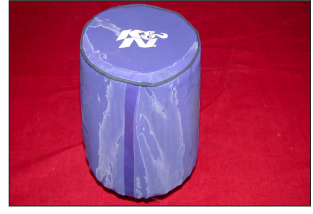
24. Install the K&N® Drycharger® onto the K&N® air filter as shown.

NOTE: Please be aware the Drycharger® is water repellent, not water proof. Depending on conditions and usage the water repellent treatment is good for 1 to 2 years. See the parts list to reorder a new Drycharger® if necessary.