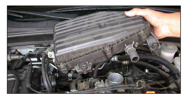
10. Pull firmly upwards to remove the throttle body plenum as shown.