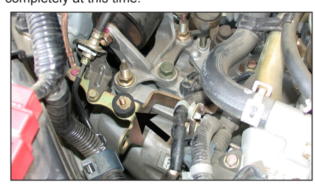
20. Install the remaining rubber mounted stud to the lower resonator mounting point as shown.