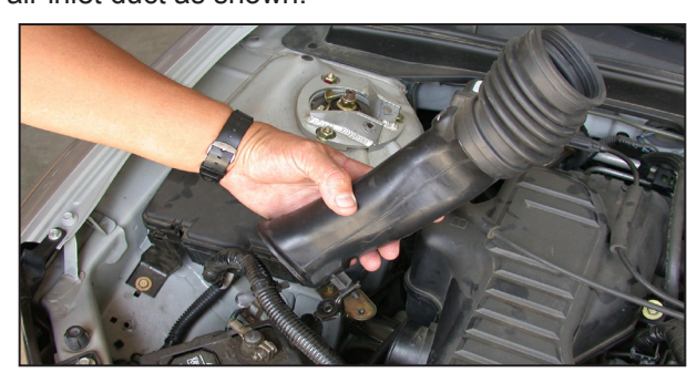
5. Remove the air inlet duct.