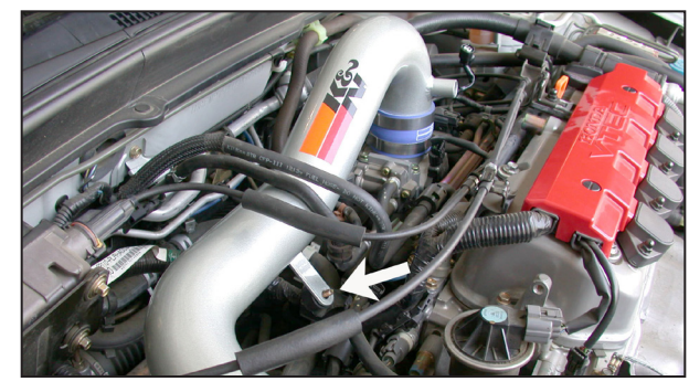
18. Install the K&N® intake tube onto the throttle body, then, line up the bracket with the rubber mounted stud as shown. Tighten hose clamps at this time.