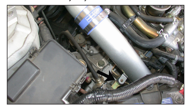
23. Slide the K&N® cold air tube onto the throttle body tube and line up the bracket with the rubber mounted stud as shown and secure with the provided hardware. Do not tighten completely.