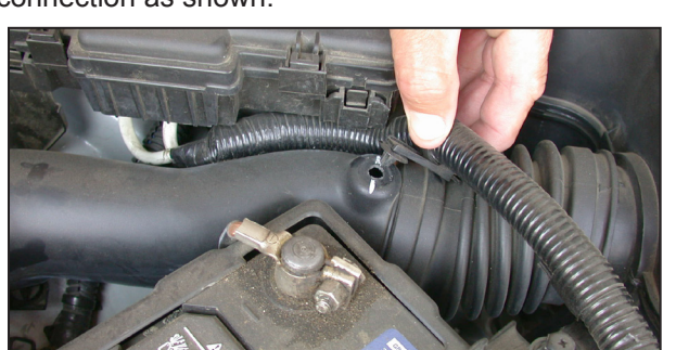
3. Unclip the battery cable from the air inlet duct as shown.