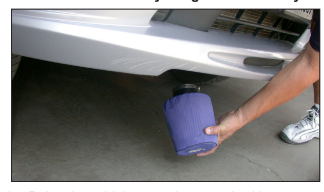
25. Raise the vehicle up and support it with jack stands, then, install the K&N<sup>®</sup> air filter from underneath the vehicle as shown.

NOTE: Please be aware the Drycharger® is water repellent, not water proof. Depending on conditions and usage the water repellent treatment is good for 1 to 2 years. See the parts list to reorder a new Drycharger® if necessary.