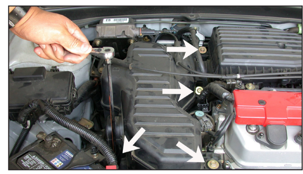
6. Loosen and remove the four bolts that secure the air intake resonator.