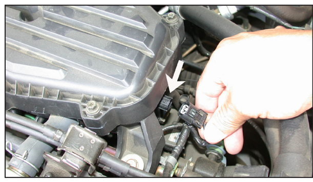
2. Disconnect the air temperature sensor electrical connection as shown.

NOTE: Disconnecting the negative battery cable erases pre-programmed electronic memories. Write down all memory settings before disconnecting the negative battery cable. Some radios will require an anti-theft code to be entered after the battery is reconnected. The anti-theft code is typically supplied with your owner's manual. In the event your vehicles' anti-theft code cannot be recovered, contact an authorized dealership to obtain your vehicles anti-theft code.