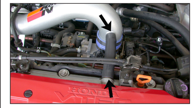
26. Install the provided silicone hose onto the crank case vent on the cam cover, then connect the other end to the vent on the K&N® intake tube as shown.