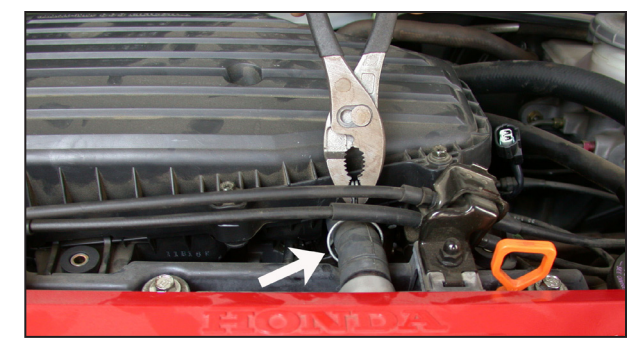
9. Using a pair of pliers, depress and pull back the hose clamp on the crank case vent at the cam cover