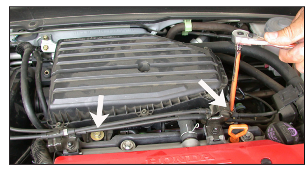
7. Loosen and remove the two bolts that secure the throttle body plenum.