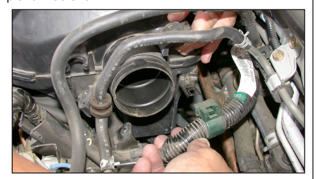
11. Using a flat blade screwdriver, unclip the wire harness from the resonator as shown.