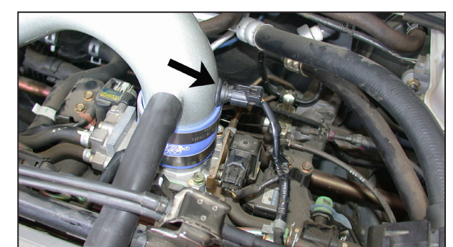
27. Reconnect the air temperature sensor electrical connection as shown.