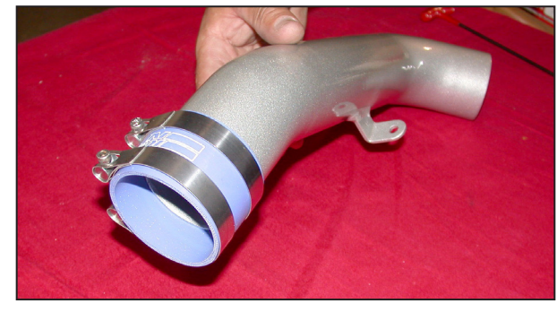
21. Install the silicone hose and hose clamps onto the K&N® cold air tube as shown.