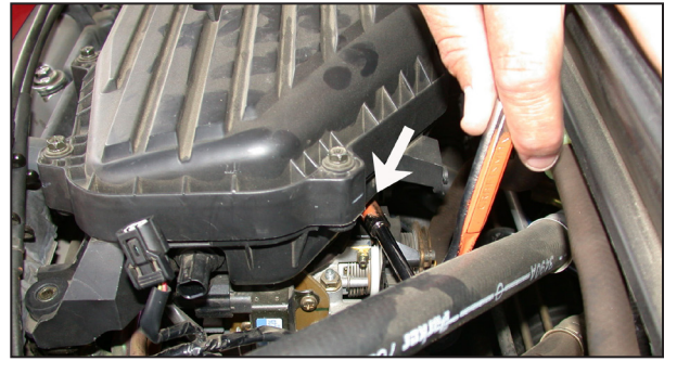
8. Loosen the hose clamp that secures the plenum to the throttle body as shown.