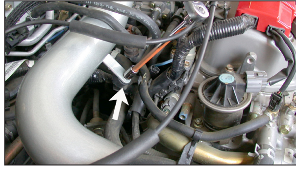
19. Secure the bracket to the rubber mounted stud using the provided hardware, but do not tighten completely at this time.