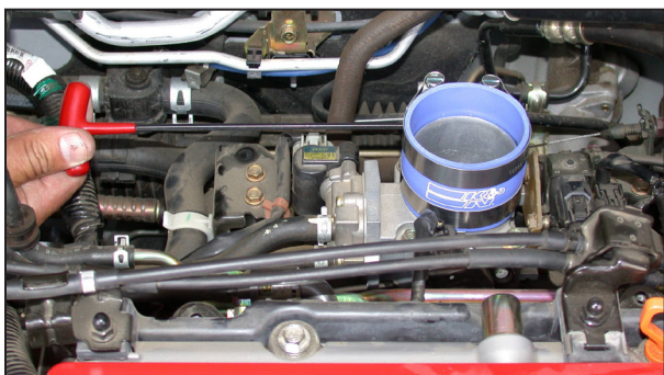
14. Install the silicone hose and hose clamps onto the throttle body. Do not tighten at this time.