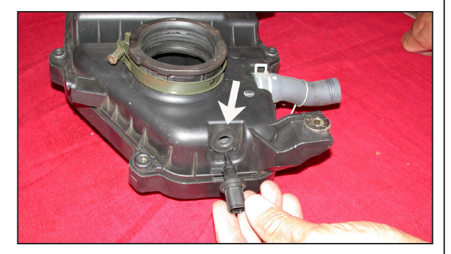
16. Remove the air temperature sensor from the throttle body plenum as shown.

NOTE: Take care removing the temp sensor as it is very fragile.