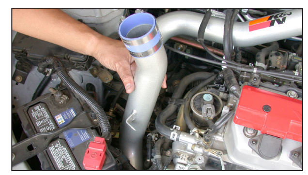
22. Install the tube as shown turning the tube in a clockwise rotation while inserting the tube in between the battery tray and the starter solenoid.