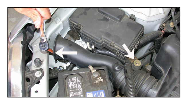
4. Loosen and remove the two bolts that secure the air inlet duct as shown.