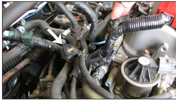
15. Install the rubber mounted stud onto the stock resonator mounting location as shown.