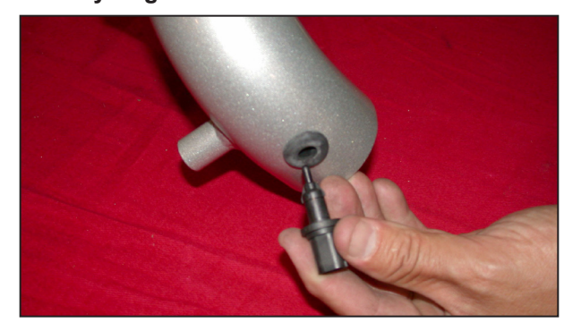
17. Install the provided rubber grommet into the hole on the K&N® intake tube, then install the air temperature sensor into the grommet as shown. NOTE: Before installing the grommet and air temperature sensor, inspect the inside of the tube for any debris, then clean the inside out with water and a towel. Inspect the tube one more time before proceeding to the next step. NOTE: Take care when handling the temp sensor as it is very fragile.

NOTE: Take care removing the temp sensor as it is very fragile.