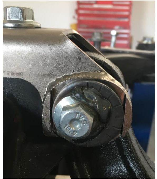
Figure 3: Steeda rear camber adjustment kit max negative camber