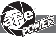
Pro DRY S Air Filter