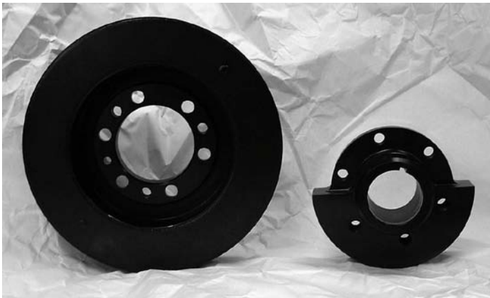
Damper Ring (A)

BALANCING OR MATCH BALANCING -Fluidamprs designed for externally balanced engines include the damper ring (A) bolted to a counter-weighted hub (B). See photo below.