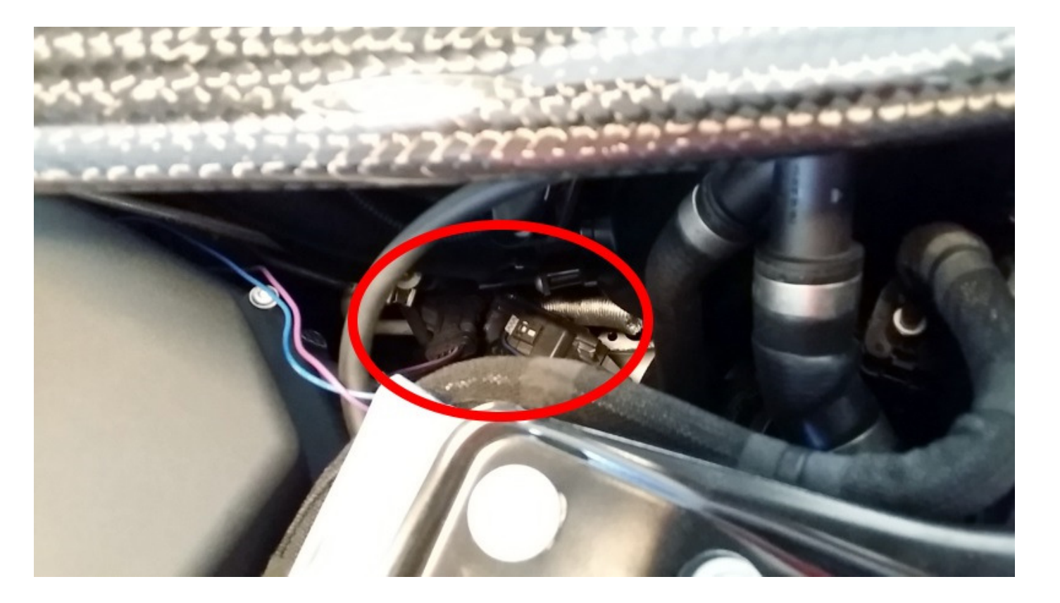
Stage 3 installation is complete! Reconnect the negative battery cable and reinstall any covers or parts you've removed during the installation process.

Refer to the n54tech S55 thread for the current map guide, most up to date firmware, and additional directions.