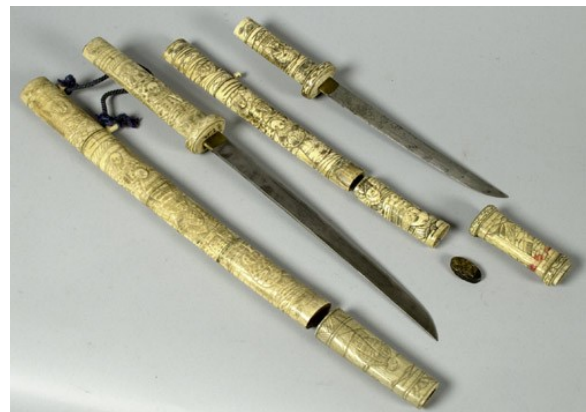
Samurai feudal Tanto daggers

their long flowing single plain edge they're also well suited for slicing.