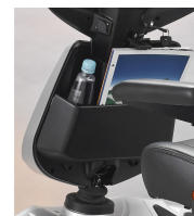
More space for storage