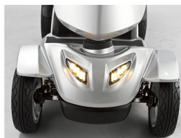
LED lighting system