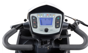
Digital LCD dashboard display