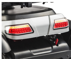
LED lighting system