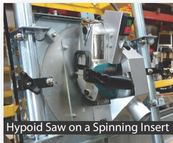
Hypoid Saw on a Spinning Insert