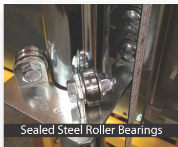
Sealed Steel Roller Bearings