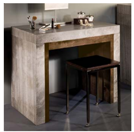
SI-MK-36 Trucco Make-up Table