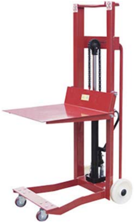
Fig. 2 Sizes and weight capacities of lifts vary by rental location and company. Confirm that the rental company can supply one that will fit in the bathroom where the Siena is being

installed and also between the legs of the unit.