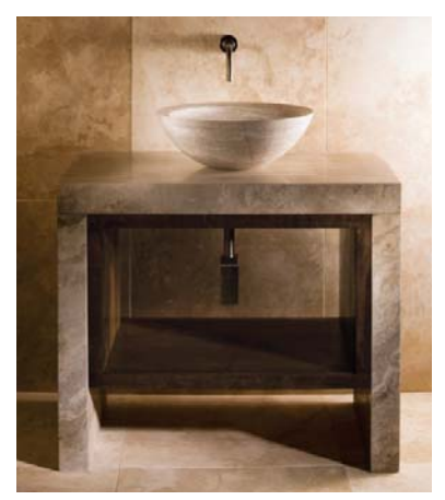
SI-CS-36 Lastra Console

6. Slide wood insert into position resting on the floor. The wood insert face should be flush with the front of the legs and top.