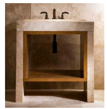
SI-IN-36 Recesso Vanity