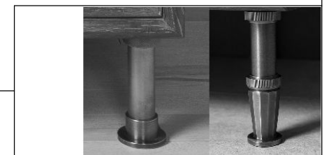
circle one: CLASSIC FACET