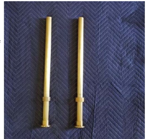
5) Leg assembly using 31" tube, foot and collar.